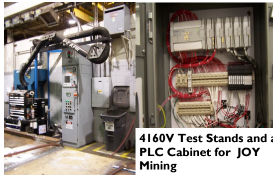
4160V Test Stands and a PLC Cabinet for JOY Mining