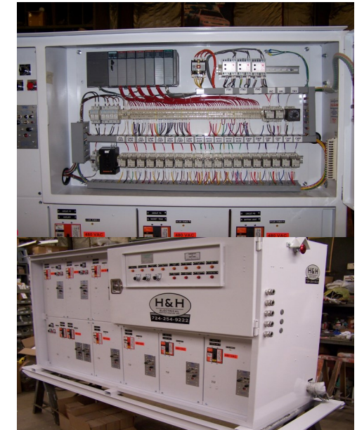
Underground Dewatering skid for CONSOL Energy. PLC Controlled

Variable Frequency drives are essential when enhanced motor control is desired. At H&H we can provide you with any type of variable frequency drive in any type of enclosure you desire.