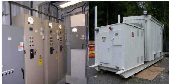
Soft Start Pump Control for water discharge at a CONSOL Energy Prep Plant