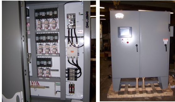
Advanced HMI touch panel control for a tire shredding plant

Using advanced programming software we can develop operator interface programs that will run on touch screen technology. This technology will do multiple tasks that are currently done with mechanical pushbuttons, lights, and switches; thus reducing the chance of mechanical failure. This is a great benefit saving you both time and money.