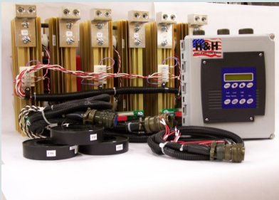
H&H Soft Start Control Design